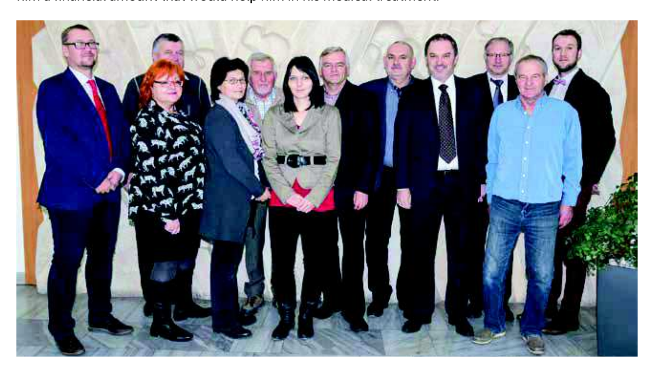
Meeting with Mayors and Deputy Mayors of surrounding municipalities

A traditional company's Christmas party took place in December. Within that event, new employees were introduced, employees that have been working in the company for more than 30 years were awarded and a symbolic cheque was given to the mother of a handicapped boy. The company gave him a financial amount that would help him in his medical treatment.