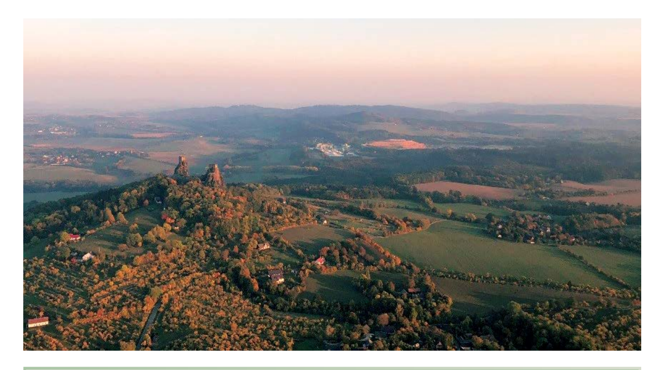
"We care for environment."

A supplier's company ensures continuous monitoring of surface and underground water in close and wide surrounding of the deposit. The target is the ability to prognosticate the development of ground water in the structures supplying water to public. The existing monitoring was extended by a gravimetric survey of the foreground of the deposit, which will extend the information on the movement of surface water and groundwater. The monitoring of 2018 again does not show decrease of water. To the contrary, the water level in the objects monitored are stagnating or slightly increasing.