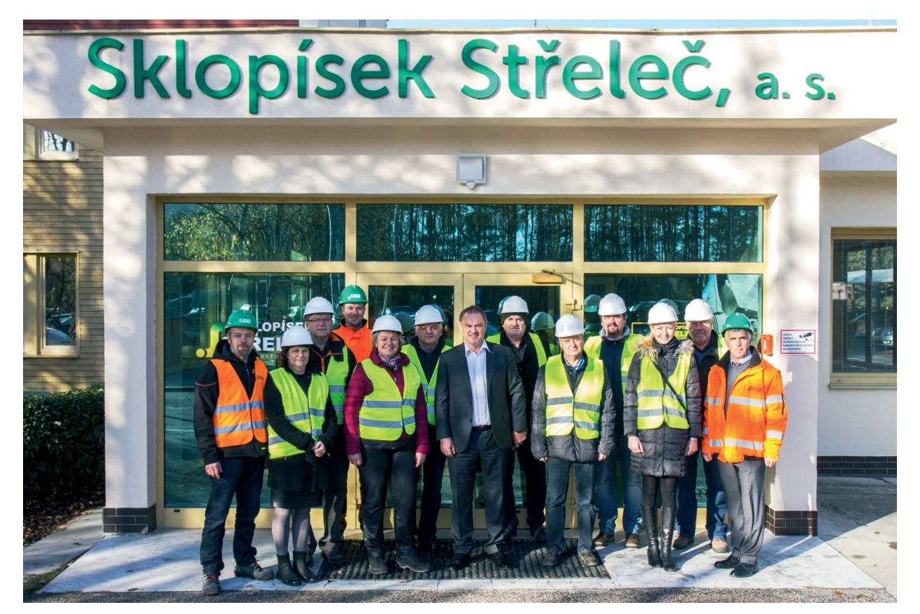
Meeting with the mayors and deputy mayors of neighbouring municipalities.

A traditional company's Christmas party was held in December. The new recruits and the employees working in the company for 5, 10, 15, 20, 25, 30, and 35 years were introduced during the evening. At the same time, a symbolic cheque was awarded to the mother of a disabled boy for buying an electric positioning system for his electric wheelchair.