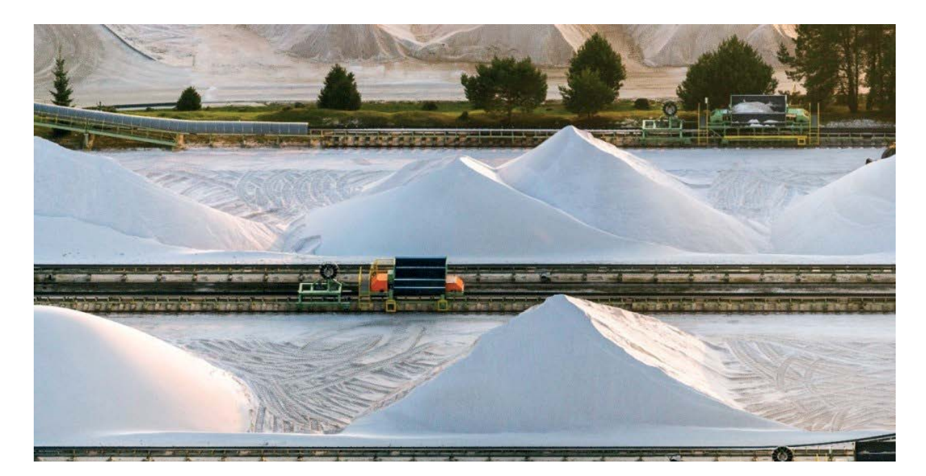
"Immediate availability of sand and customers' satisfaction are important to us."

We are pleased to be perceived as a reliable and strong partner able to respond to customers' needs. Our production and storage capacities together with our technical equipment and the flexibility of our shipping points allow us to implement immediate and uninterrupted year-round supplies of sand.