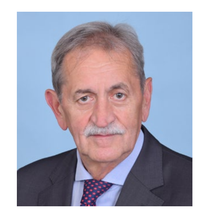
Dear Shareholders, Dear Business Partners, Dear Employees,

We have behind us another difficult year, one affected by external turbulence, in particular sudden changes on the customer side of the equation. Fluctuating sales which could not have been foreseen influenced the systematic planning and organization of our production work. Responses to these changes required an enormous level of commitment from all our employees. I am glad to say that we managed to quickly and effectively implement changes in production programs and all related activities to meet the needs of our customers.